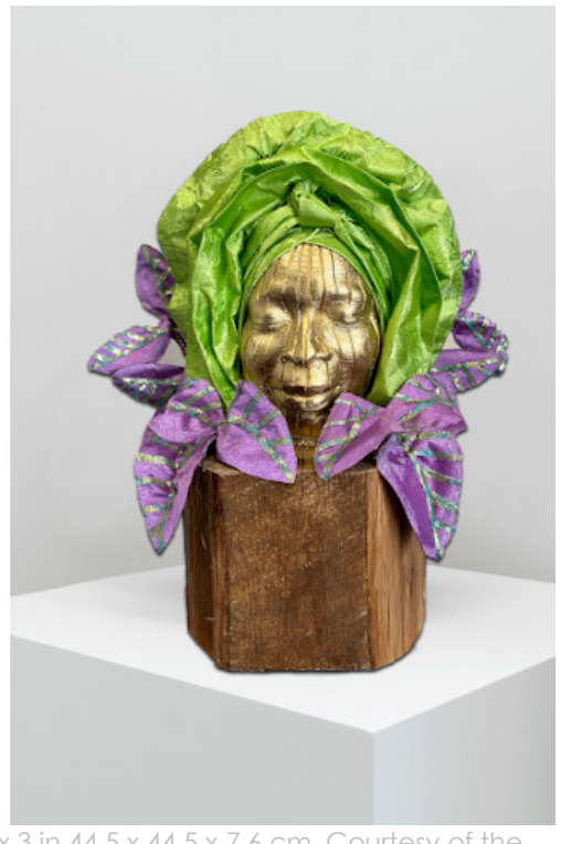
Left: Layo Bright - Adebisi X, 2023 kiln formed glass 17 1.2 \times 17 \cdot 1.2 \times 3 in 44.5 x 44.5 x 7.6 cm. Courtesy of the artist and Monique Meloche Gallery. / Right: Layo Bright - Aso Ebi Electric Green & Lavender, 2023. Gele, ceramic, pigment, wood, Ghana-Must-Go bag, 21 x 20 x 13 in 53.3 x 50.8 x 33 cm. Courtesy of the artist and Monique Meloche Gallery.