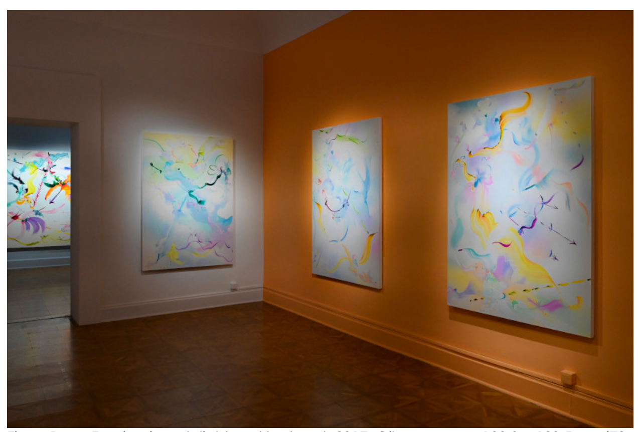
Fiona Rae - Faerie gives delight and hurts not, 2017. Oil on canvas, 182.9 \times 129.5 cm (72 \times 51 in.)