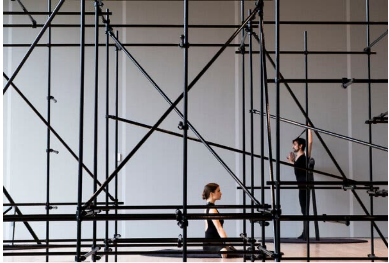
Dancers performed as part of the "Master and Form II" installation by Fernandes at the Whitney Museum of American Art in 2019.

Fernandes said "Returning to Before" was "an hourlong piece, but there are moments where the dancers become statues." They stop to think or rest, but also to mimic the positions of Edmonson's sculptures. "They are meditating," he added. "They are creating this space of peacefulness within the museum."