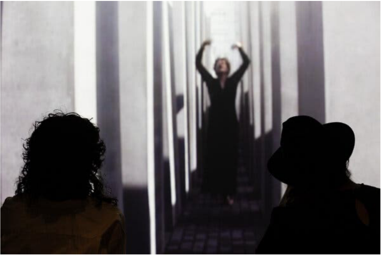
Carrie Mae Weems's 2013 video piece "Holocaust Memorial" on view at London's Barbican Center.